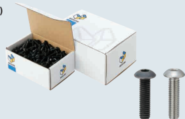
Cap Screws – Hexagon Socket Button Head (Box)