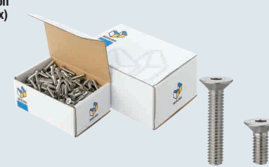
Cap Screws – Hexagon Socket Flat Head (Box)