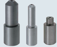
Locating Pins – Small Flat Head with Tapped Shank