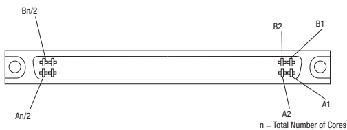
FCN Female Connector Contact Arrangement Diagram